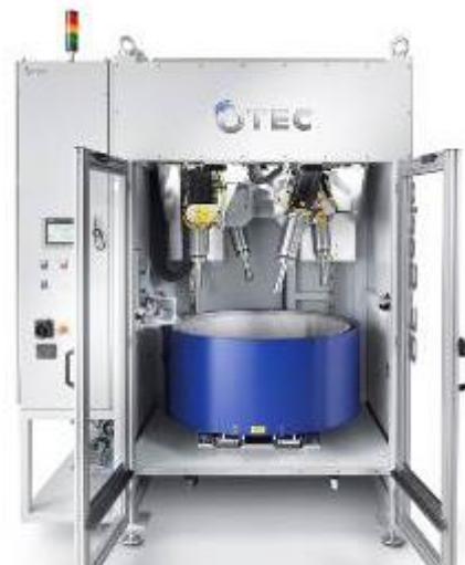
SF 4 Standard stream finishing machine

OTEC's stream finishing machine can deburr, round and smooth turbine blades in a single processing stage. After they have been manufactured, turbine blades exhibit considerable initial surface roughness and excessively sharp edges and must therefore be subjected to high-precision surface finishing before they can be used in an aircraft or for generating electricity. This entails both smoothing the surface and rounding the edges. In OTEC machines, the surface is homogeneously smoothed, generally to Ra < 0.4