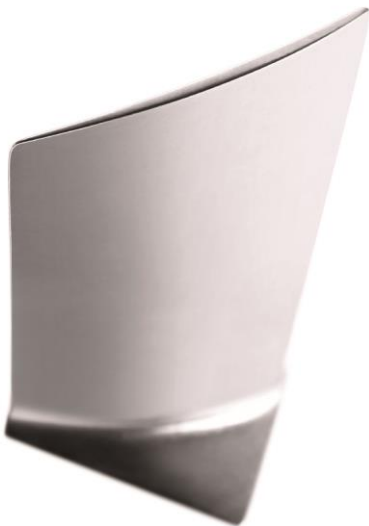
Turbine blade after OTEC finishing

\mu\text{m} and often to less than \text{Ra } 0.25 \mu\text{m} . Here, it is especially important to ensure that the shape of the blade is not damaged. Furthermore, the edges can be rounded to a predefined dimension without excessively rounding the corners of the blades. The process times are between 2 and 30 minutes. Several workpieces can be clamped in the machine at the same time, which ensures a very high throughput. The workpieces are lowered into a rotating container filled with a grinding or polishing medium. The actual working motion is generated by the flow of abrasive medium surrounding the workpiece, which also rotates independently.